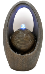
Euphoria - Item # 03820