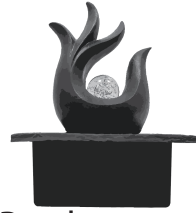
Pearl ITEM # 03800