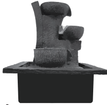
Aura ITEM # 03801