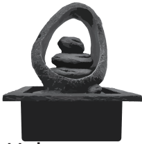
Halo ITEM # 03802

The following instructions will assist you in assembling your particular fountain. Depending on which fountain you have purchased there will be slight variations in how they get assembled.