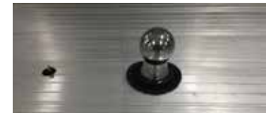
Image of Hide-A-Goose after installation.