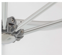
Easily Replaceable Parts