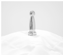
Stainless Steel Acorn Finial