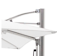
Auto Lift Assist Piston System