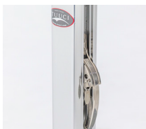
Cam Lock Lever - Allows 360° Rotation