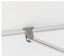
Reinforced Strut Joint Connector