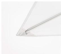
Ballistic Reinforced Screw Pocket Construction