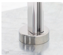
Stem Cover Plate