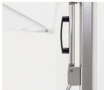
Auto Lift Assist Spring Locking Cam Handle