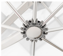
Patented Independent Bracket Hub System