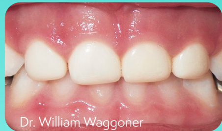
Dr. William Waggoner

Made of zirconia ceramic, NuSmile ZR offers superior nature replicating esthetics, ultimate durability and easy placement. NuSmile ZR and matching Try-In Crowns are part of an easy and convenient complete zirconia crown system that delivers the results you want for your patients.