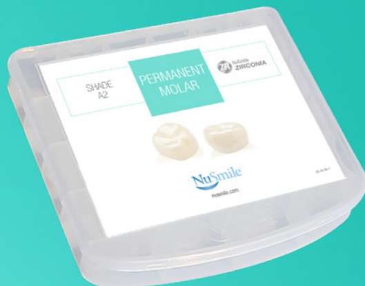
PERMANENT MOLAR KITS