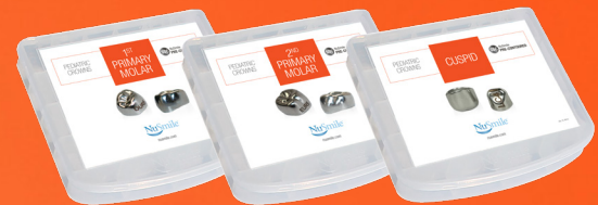
PEDIATRIC (PRIMARY TOOTH) KITS