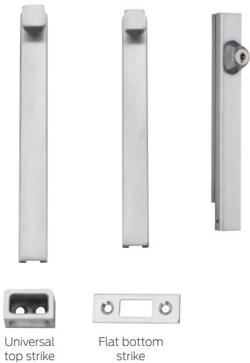
Universal top strike