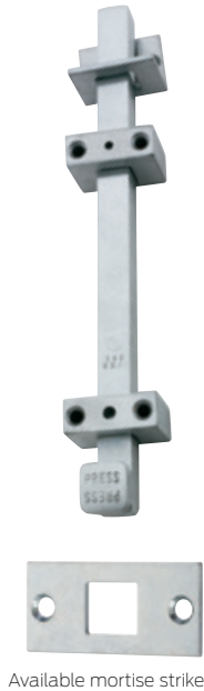
Available mortise strike