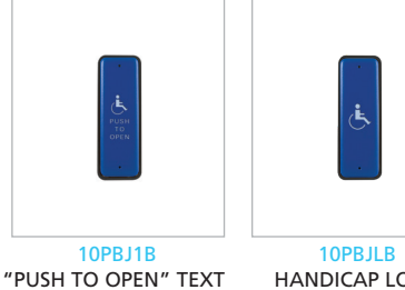
HANDICAP LOGO ONLY WHITE ON BLUE