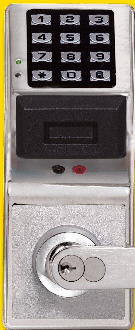
PDL5300IC Prox/PIN Lock front/back view, shown

Double-sided Trilogys for PIN code or prox access from 2 sides of the door