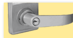
Regal handle option

Deadbolt Models: Feature stainless steel deadbolt with 1" (2.55cm) projection, latchbolt with 3/4" (1.91cm) projection and deadlocking latch. Deadbolt may be projected from key cylinder from outside door or turn-piece from inside door.