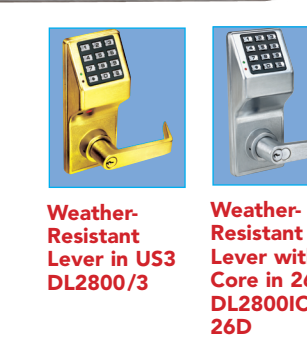
Weather-Resistant Lever in US3 DL2800/3