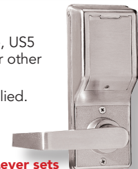
Lever sets feature clutch mechanism ensuring longer life and complies with ADA specs providing barrier-free access to the disabled.