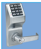
Weather-Resistant Lever with IC Core in 26D DL2800IC/26D