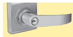
Regal handle option

COMPLIANCES: Grade I, heavy duty cylindrical lockset, UL listed to the 10C Positive Pressure Specification and FCC certified. ADA compliant levers.