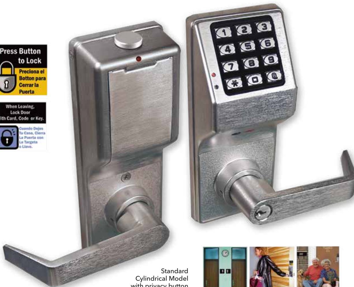
Standard Cylindrical Model with privacy button (center, top) featured