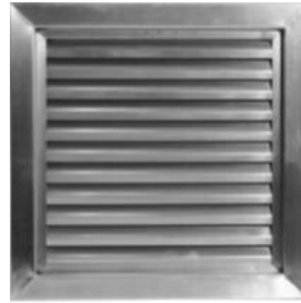
800A1 in Optional Stainless Steel Finish

Inverted "Y" Blades Recommended for Schools, Class "A" and Institutional Buildings.