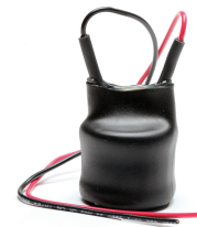
Magnetic lock kit