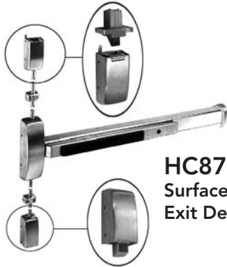
HC8700 Series Surface Vertical Rod Exit Device