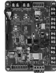
ADA1028W Wireless Interface Module