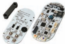
ADA1005WP Electronic control kit for Pro setup and PC board (white board) ADA1005WN Electronic controlkit for NYCTRD setup and PC board (white board)