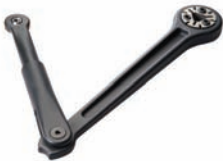
ADA1001 Door arm assembly