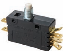
ADA1022 Kit to convert SPDT switch to DPDT switch