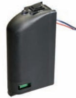
ADA1007P Battery assembly