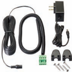
ADA1015P Kit: transformer, armored door cord, end links 50' of low voltage cable, power port cnt.