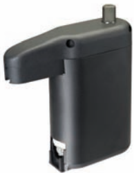
ADA1010P* Operator body - ADAEZ PRO ADA1010NY* Operator body - NYC TRD ADA1010E* Operator body - Europe