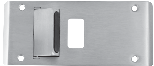
Center Hung Door - Cylindrical Latch CR4591 - 5-3/4" Frame CR4592 - 6-3/4" Frame