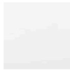
S8 - Painted White