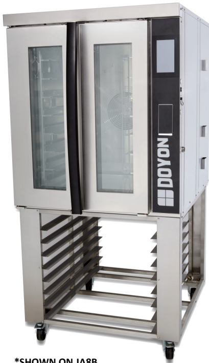
*SHOWN ON JA8B

PROJECT _____ ITEM NO. _____ NOTES _____ MODEL NUMBER: JA8X , JAX8G , JA8XR