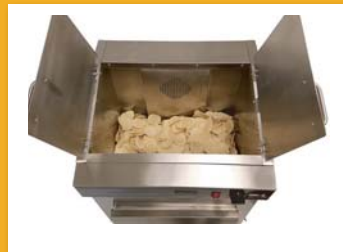
Easy Load Doors