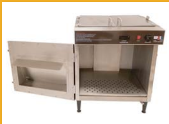
Easy-To-Clean Holding Compartment

This easy to use chip warmer will hold up to 26 gallons of chips and maintain them at an ideal serving temperature. With its all stainless steel construction and easy access holding compartment, it is a breeze to clean and maintain. The digital temperature indicator and adjustable thermostat ensure that the chips are always served at the proper temperature. This warmer utilizes convection heating with a circulating fan to make sure that all of the product gets heated evenly with a range from 90-180 degrees F. The 4" legs make it easy to clean under the unit while the double hinged loading doors make it simple to add chips.