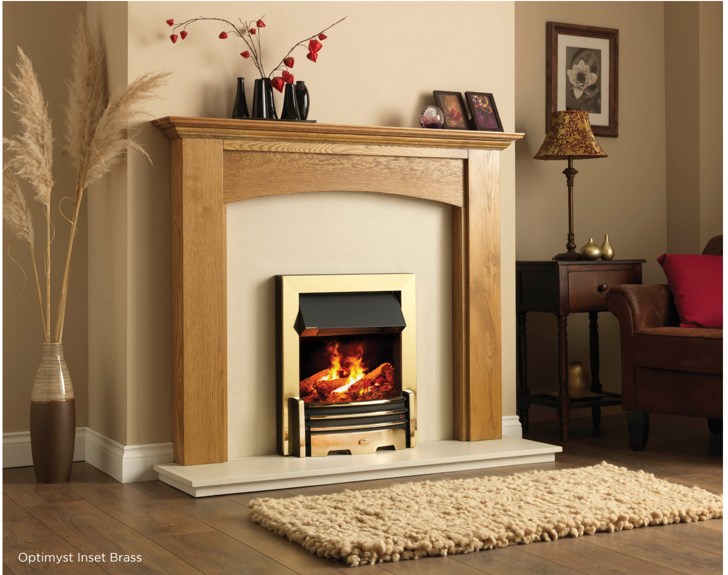
Optimyst Inset Brass

This inset electric fire features a traditional brass effect finish, and is suitable for many rooms including the lounge, dining room and conservatory.