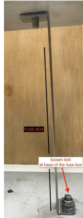
Correct Brace Orientation