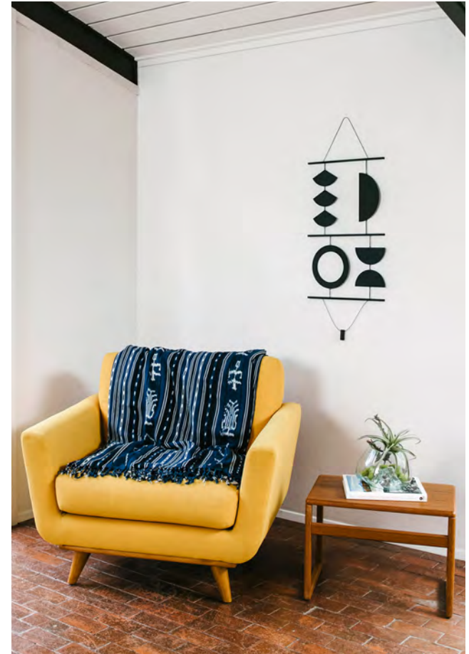
Quadrant Wall Hanging Black Patina