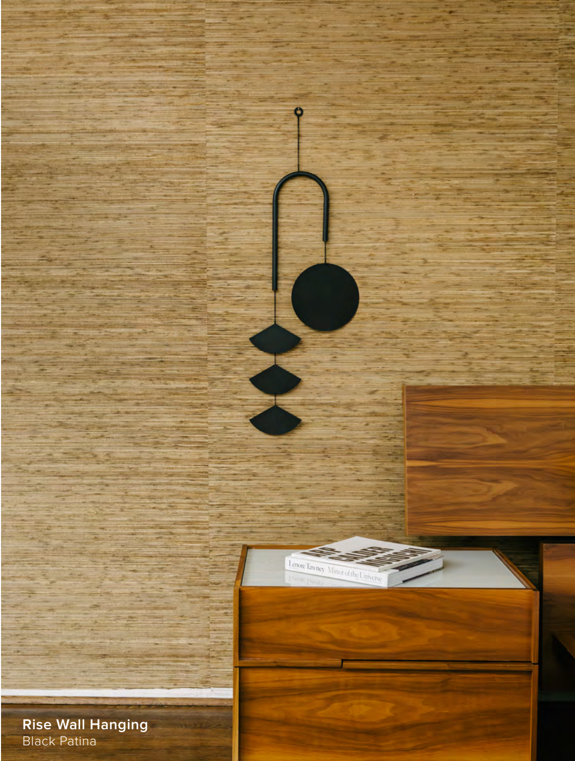
Rise Wall Hanging Black Patina