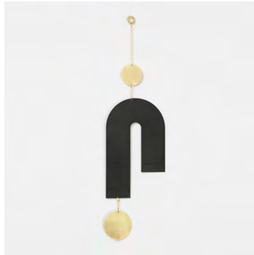
Turn Wall Hanging — Black Patina / Brass