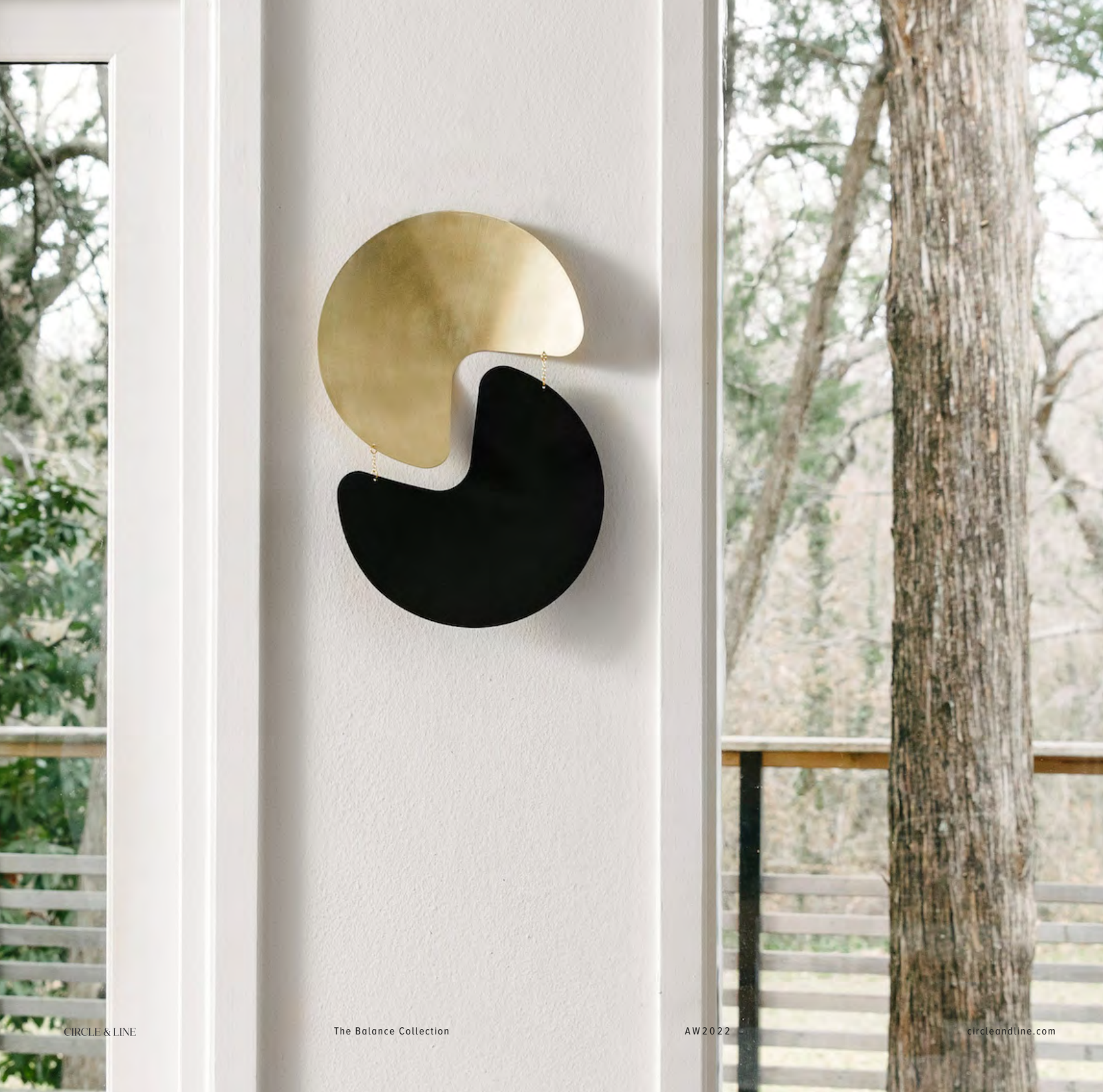
Echo Wall Hanging Black Patina / Brass