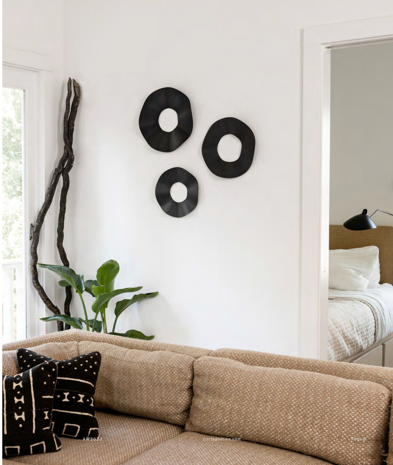
Ripple Wall Hanging Black Patina

The Ripple Wall Hangings are hand-formed, creating a soft, undulating, three-dimensional form that feels as if it were floating off the wall. The set should be hung intuitively to fit the space and each other.