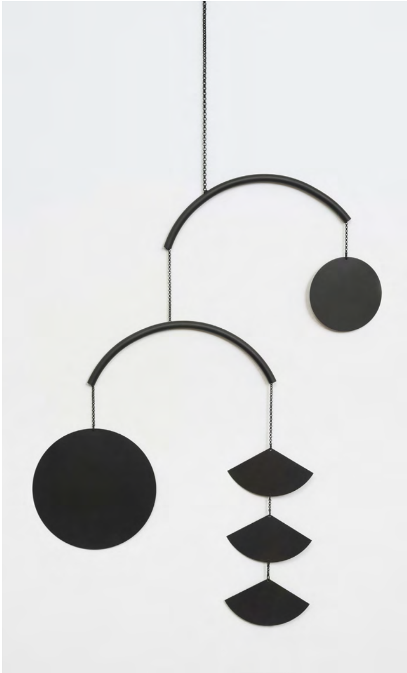
Radiant Mobile Black Patina