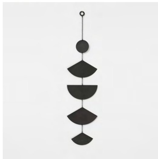
Aurora Wall Hanging — Black Patina