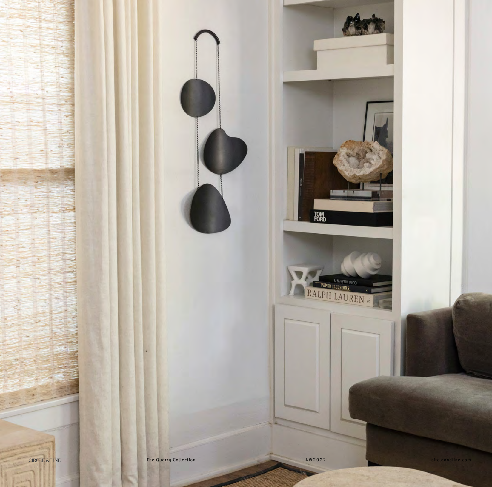
Rill Wall Hanging Black Patina