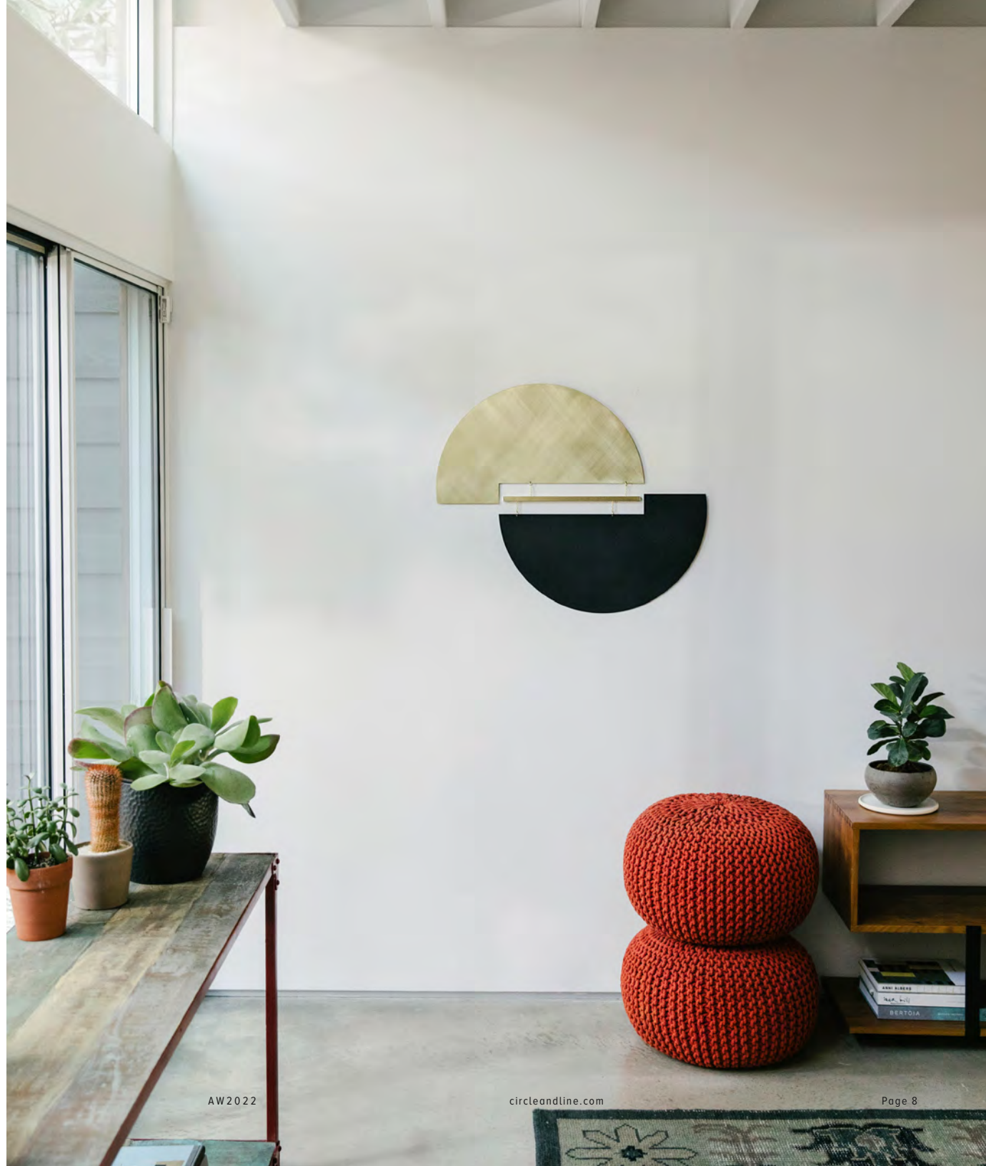
Meridian Wall Hanging Black Patina / Brass

The pieces in The Balance Collection are inspired by the idea that two things can simultaneously be opposites and complementary. The striking black patina and polished brass, both hand-finished, create visual harmony within a balanced composition.