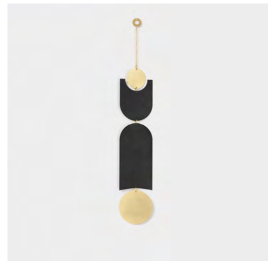
Reflect Wall Hanging — Black Patina / Brass