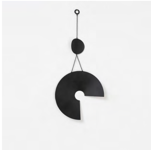
Encircle Wall Hanging — Black Patina