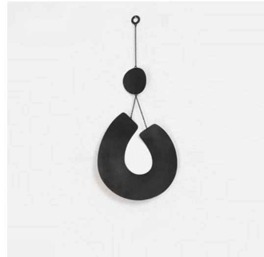
Bend Wall Hanging — Black Patina