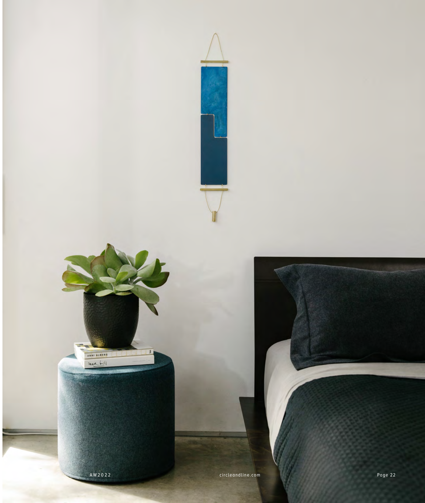
Inverse Wall Hanging Blue Patina / Brass

The Blue Patina Collection is inspired by the interaction of light and water. We paint every piece individually by hand, making each one unique, like a watercolor painting. The combination of vibrant patina, blue matte powder coating, and luminous polished brass creates a sense of harmony and wonder within each design, animating its environment.