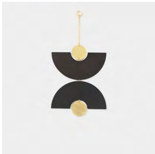
Double Arc — Black Patina / Brass