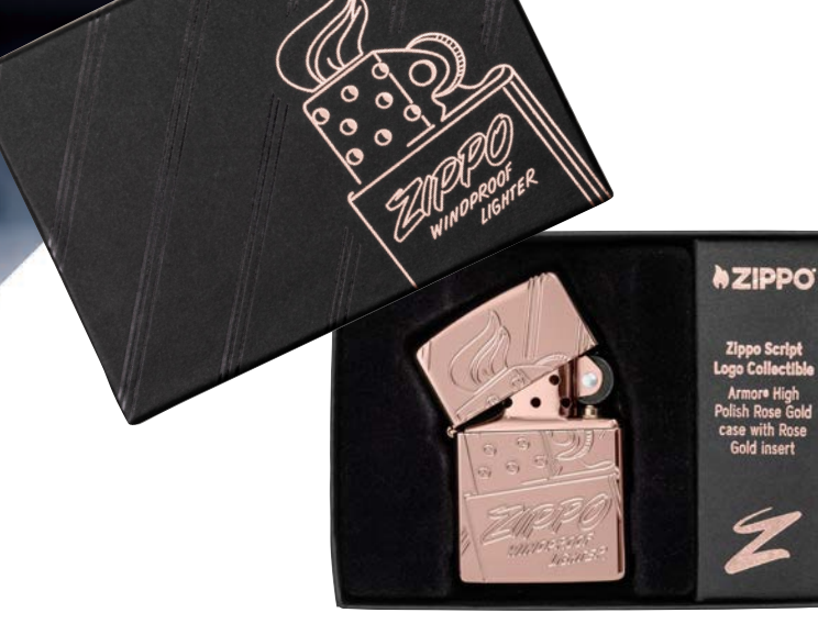
Special collectible packaging