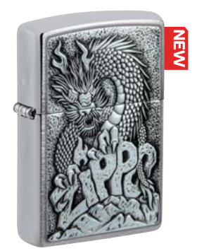
48902 Brushed Chrome Emblem Attached