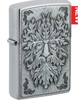
Brushed Chrome Emblem Attached