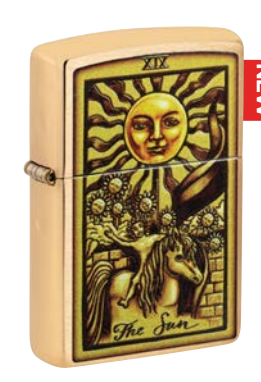
48758 Brushed Brass Color Image