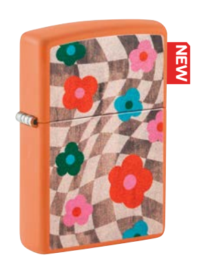
48718 Orange Matte Color Image