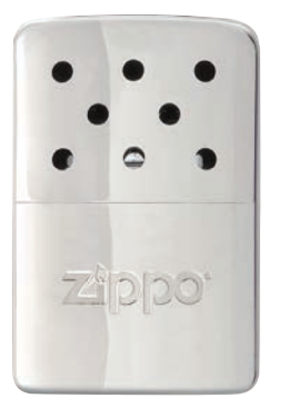
40360 - EU 40451 - Asia High Polish Chrome