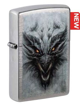
Linen Weave Color Image