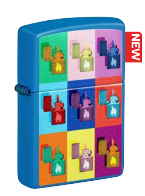
48722 Sky Blue Matte Color Image