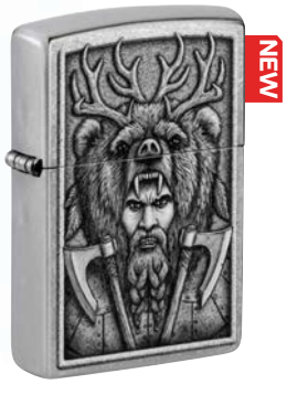
Street Chrome Color Image