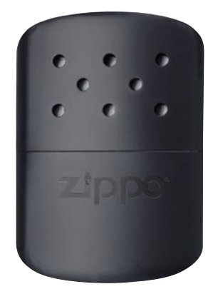
40368 - EU 40454 - Asia Black