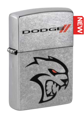
48760 Dodge Street Chrome Color Image

Dodge is a registered trademark of FCA US LLC and used under license by Zippo Manufacturing Company.