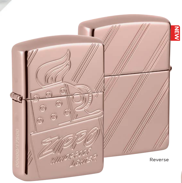
48768 Armor® High Polish Rose Gold Deep Carve/Laser Engrave