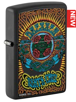
Santa Cruz Black Matte