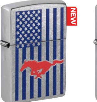
48754 Ford® Street Chrome Color Image

and used under license by Zippo Manufacturing Company.