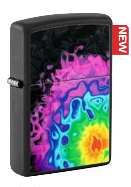
48733 Black Matte Color Image

Playboy Available in select countries. Some restrictions apply.