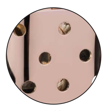
Rose Gold Insert