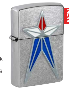
48903 Street Chrome Emblem Attached