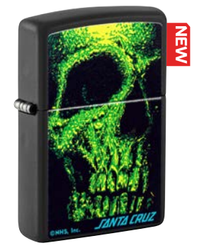
48743 Santa Cruz Black Matte Color Image