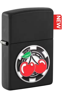
48905 Black Matte Emblem Attached