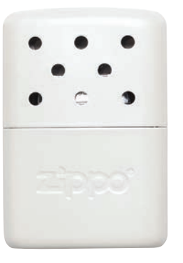
40361 - EU 40452 - Asia Pearl