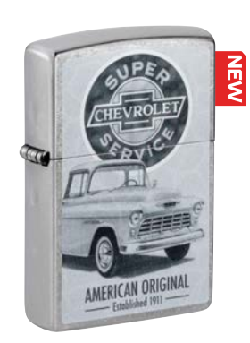
48757 Chevrolet Street Chrome Color Image

General Motors Trademarks used under license to Zippo Manufacturing Company.