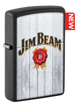
48741 Jim Beam® Black Matte Color Image

Jim Beam® Available in select countries. Some restrictions apply.