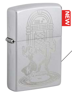
48728 Satin Chrome Lustre