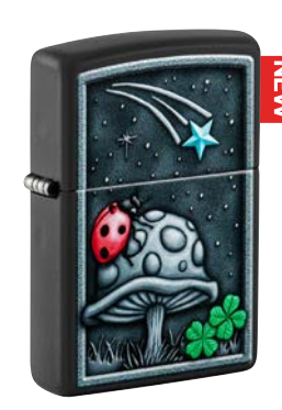
48724 Black Matte Color Image