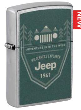
48766 Jeep® Street Chrome Color Image

Jeep® Available in select countries. Some restrictions apply.