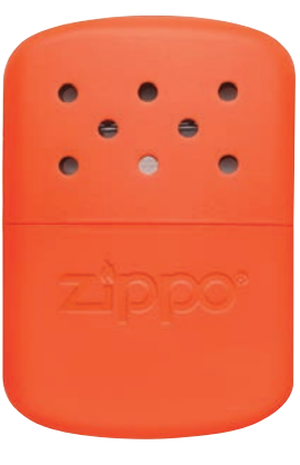
40378- EU Blaze Orange