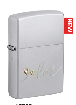
48725 Satin Chrome Auto-Two-Tone