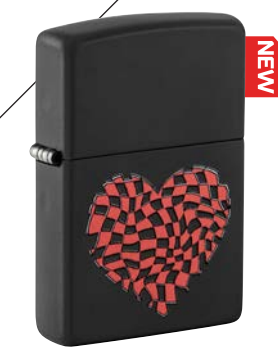
48719 Black Matte Color Image