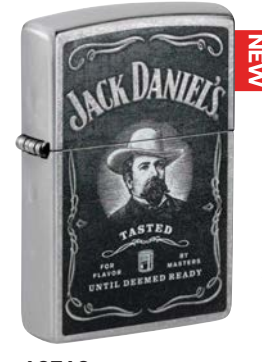
48748 Jack Daniel's® Street Chrome Color Image

JACK DANIEL'S and OLD NO. 7 are registered trademarks used under license to Zippo Manufacturing Company. \circledcirc 2023, Jack Daniel's — All Rights Reserved. Your friends at Jack Daniel's remind you to drink responsibly. For sale to adults of legal drinking age.