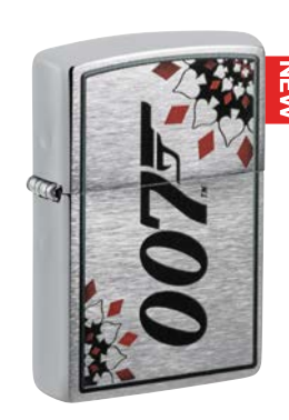
48734 James Bond Brushed Chrome Color Image