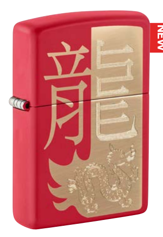
48769 Red Matte Laser Engrave/Auto Engrave