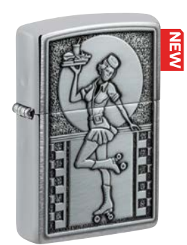
48904 Brushed Chrome Emblem Attached