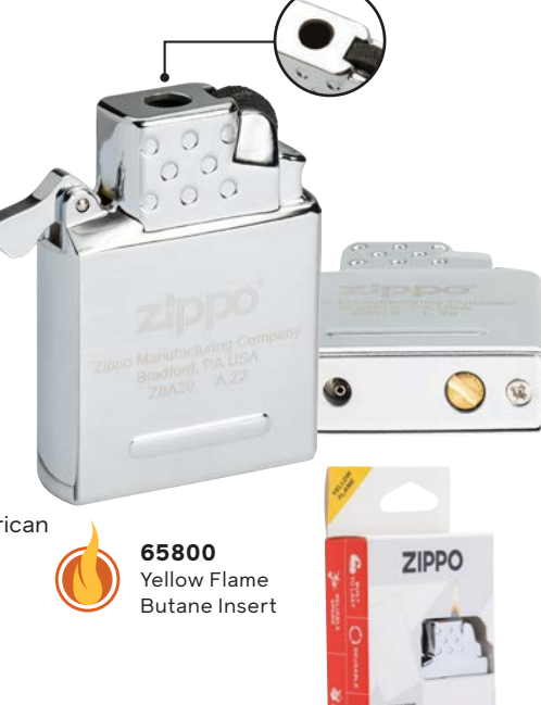
Standard packaging for Yellow Flame Butane Insert