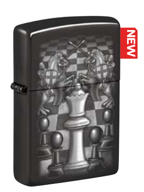
48762 High Polish Black Photo Image