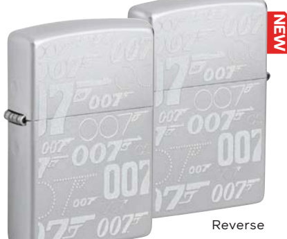
48735 James Bond Satin Chrome Color Image