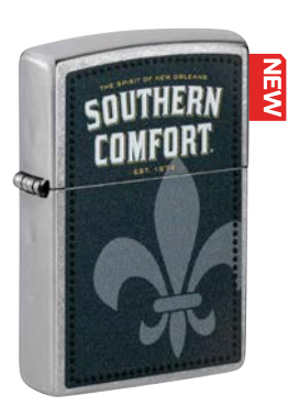
48747 Southern Comfort® Street Chrome Color Image