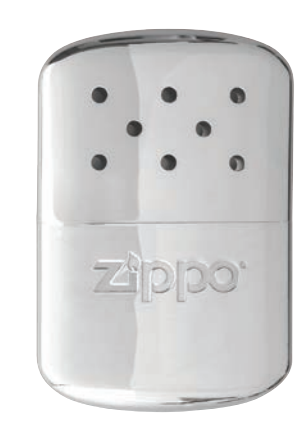
40365 - EU 40453 - Asia High Polish Chrome