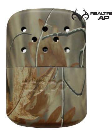
40420 - EU While Supplies Last 40455 - Asia While Supplies Last