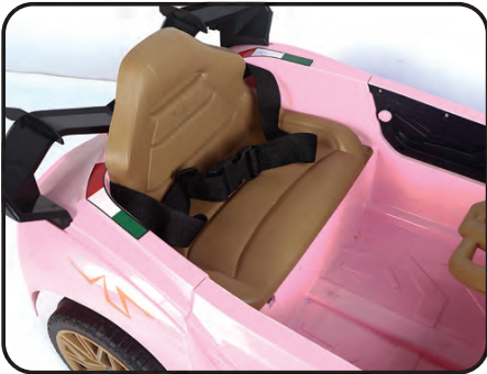
10. Install the seat.