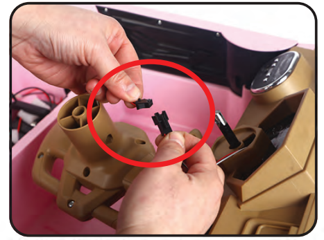
6. Connect the power to the steering wheel.