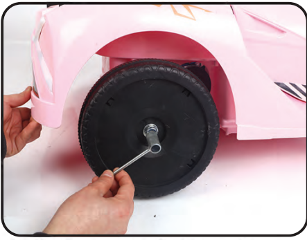
4. Put the gaskets on and tighten using proper tools.