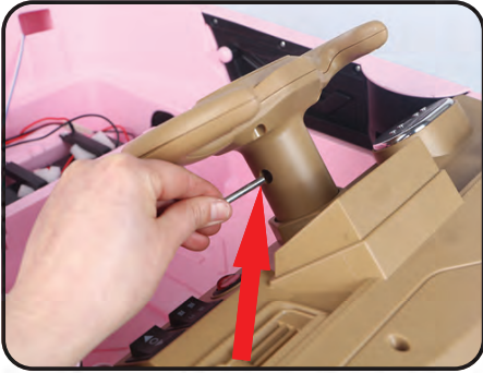
7. Attach the steering wheel and tighten the screw.