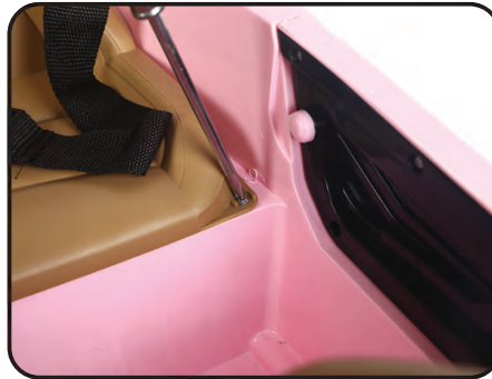
11. Secure the seat - tighten the screws on both sides.