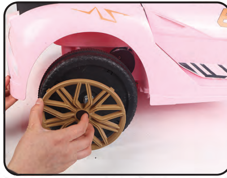
5. Attach the wheel covers.