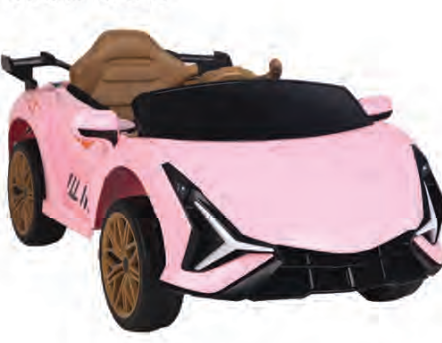
14. Assembly is now complete.