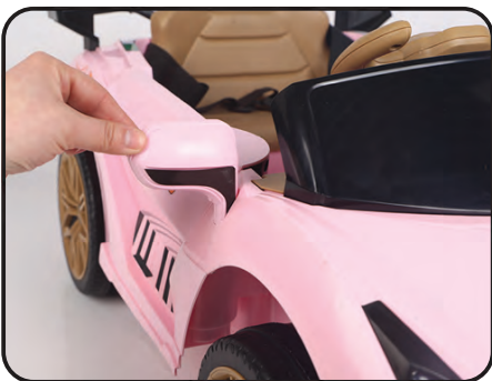
13. Install the mirrors.