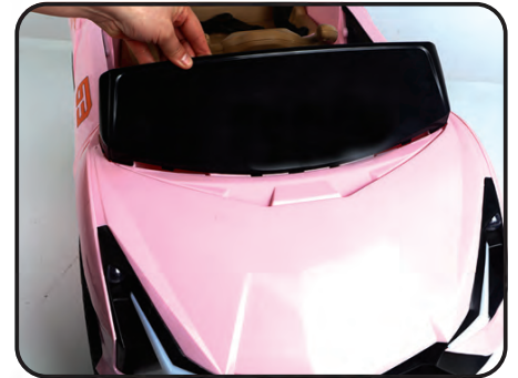
12. Install the windshield.