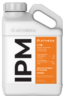
IPM Broad Spectrum Insecticide & Fungicide

If the grower sees any adverse reaction in the plants, stop and take a day or two off before re-applying.