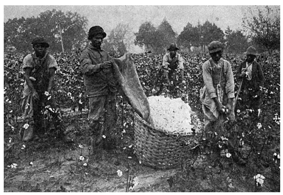
Prior to the Civil War, slaves made up almost the entire work force on plantations in the South.