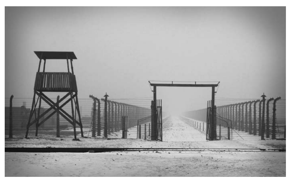
Auschwitz concentration and extermination camp, where more than a million people died during World War II, most of them Jews.

Middle East, South America, and so on. But did you know that the concept of human races is not found in the Bible? The philosophy of racism, therefore, is alien to Scripture and originated with men.