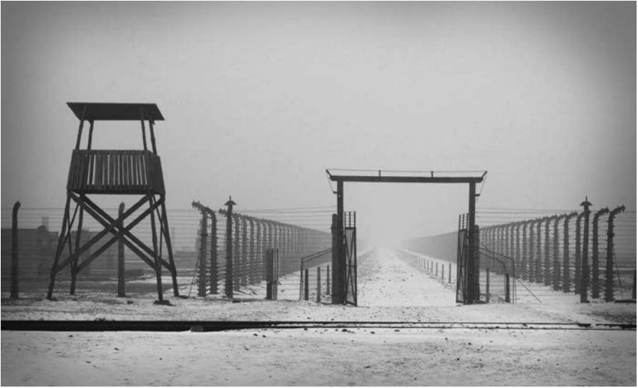
Auschwitz concentration and extermination camp, where more than a million people died during World War II, most of them Jews.

Middle East, South America, and so on. But did you know that the concept of human races is not found in the Bible? The philosophy of racism, therefore, is alien to Scripture and originated with men.