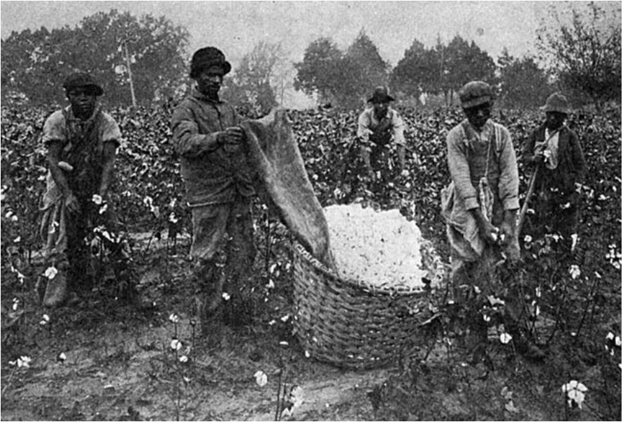
Prior to the Civil War, slaves made up almost the entire work force on plantations in the South.

Members of the Ku Klux Klan, a white supremacist organization, marching through the streets.