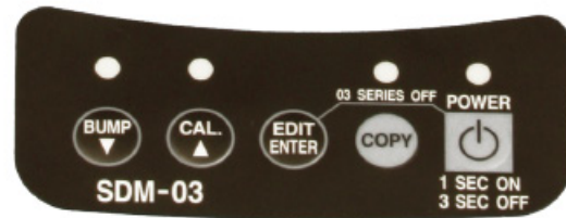
Control Panel View