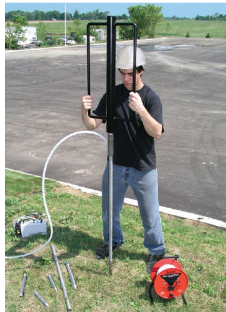
Installing Piezometers with a Manual Slide Hammer

Solinst Drive-Point Piezometers can be driven into the ground with any direct push or drilling technology, including the Manual Slide Hammer shown at right. To avoid clogging or smearing of the screen during installation, a shielded version is also available.