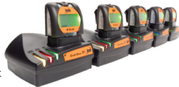
Cub's linked together within their docking stations.

Upgradeable ppb sensitivity can be purchased quickly and easily. CubDoc docking stations are available for USB communication, charging and calibrating your instrument, dependent on your requirements.