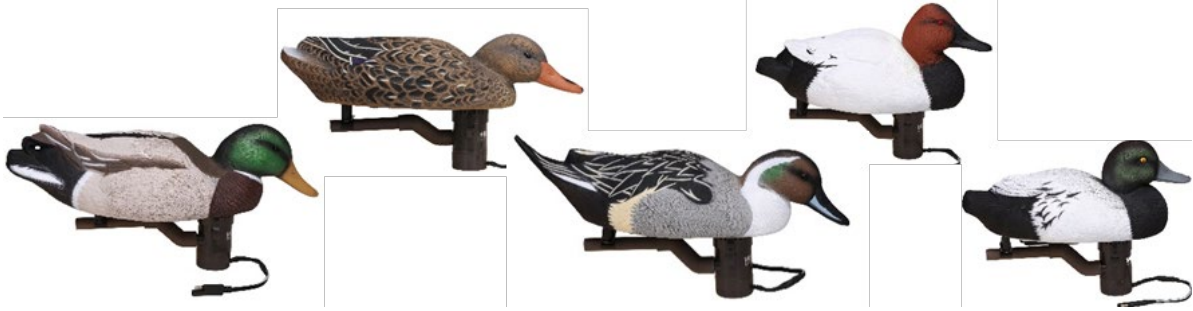
Recalled Swimmer Model Decoys