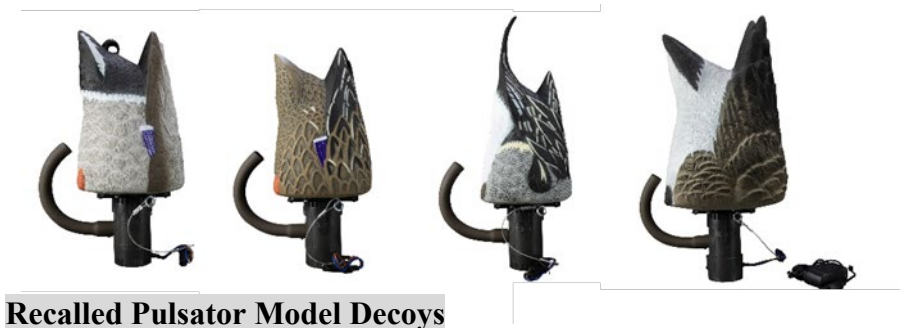
Recalled Pulsator Model Decoys