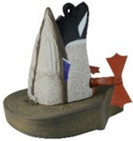
Recalled Crazy Kicker Model Decoys