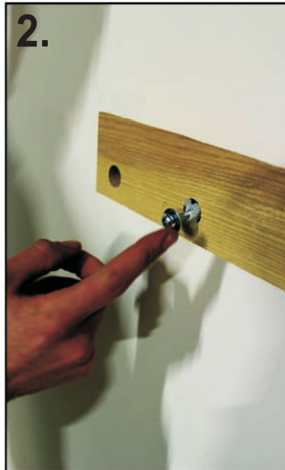
2. Thread the metal screw through the plastic washer until it threads till the wall