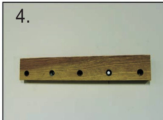
4. Fix all the screws firmly in the 5 slots provided