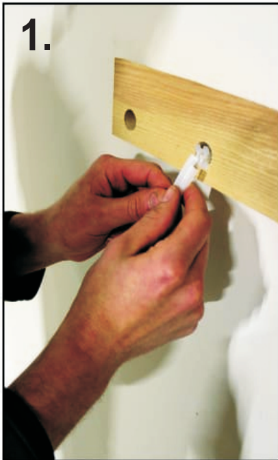
1. Insert the plastic dry wall anchor inside the hole drilled into the wall through the wooden support

ITEM DESCRIPTION : WALL MOUNTING 2 DRAWER CONSOLE