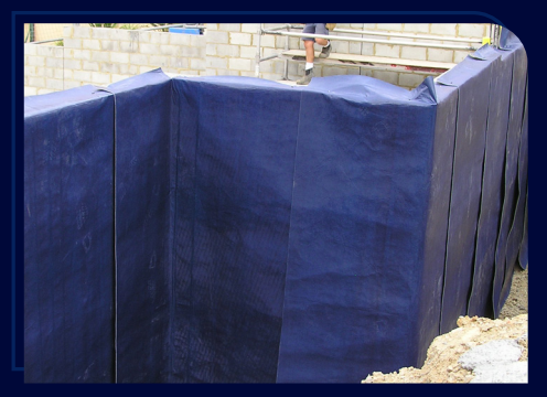
EXTERNAL RETAINING WALL

RETAINING WALL AT NSW RUGBY CENTRE OF EXCELLENCE