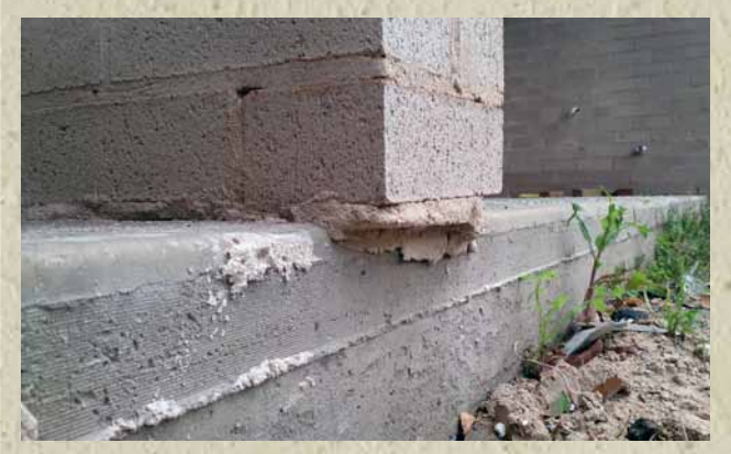
Overhanging brickwork with mortar fill correctly applied to the outside core holes.