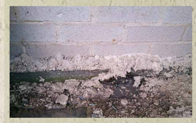
Excess mortar dropped during brick laying must be cleared from the base of the wall to allow installation.