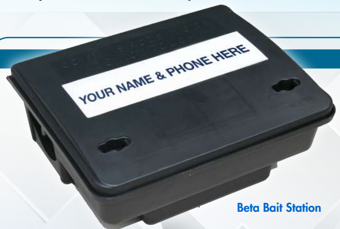
Beta Bait Station

RODENTHOR Block Rodenticide fits perfectly inside the Stations. All ENSYSTEX Stations can be personalised with your company name and phone number.