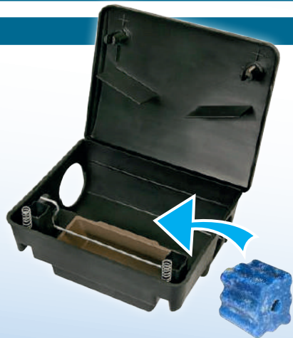
Peti Bait Station

The ENSYSTEX Beta and Peti Bait Stations are the most cost effective rodent Stations in Australia, with child resistant features, rod for wax blocks and a patented quick release system for securing to the wall