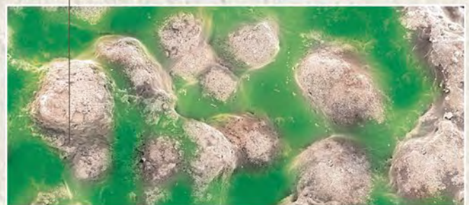
NOVITHOR forms an impenetrable termite proof zone