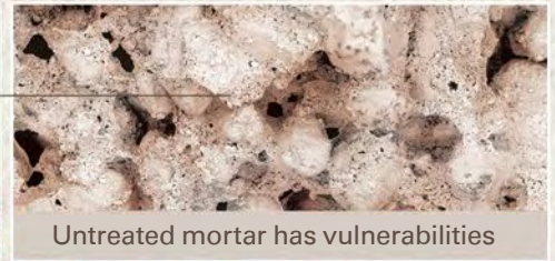
Untreated mortar has vulnerabilities