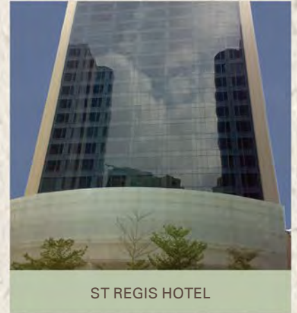
ST REGIS HOTEL