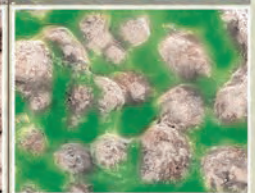
MICROSCOPIC AFTER NOVITHOR