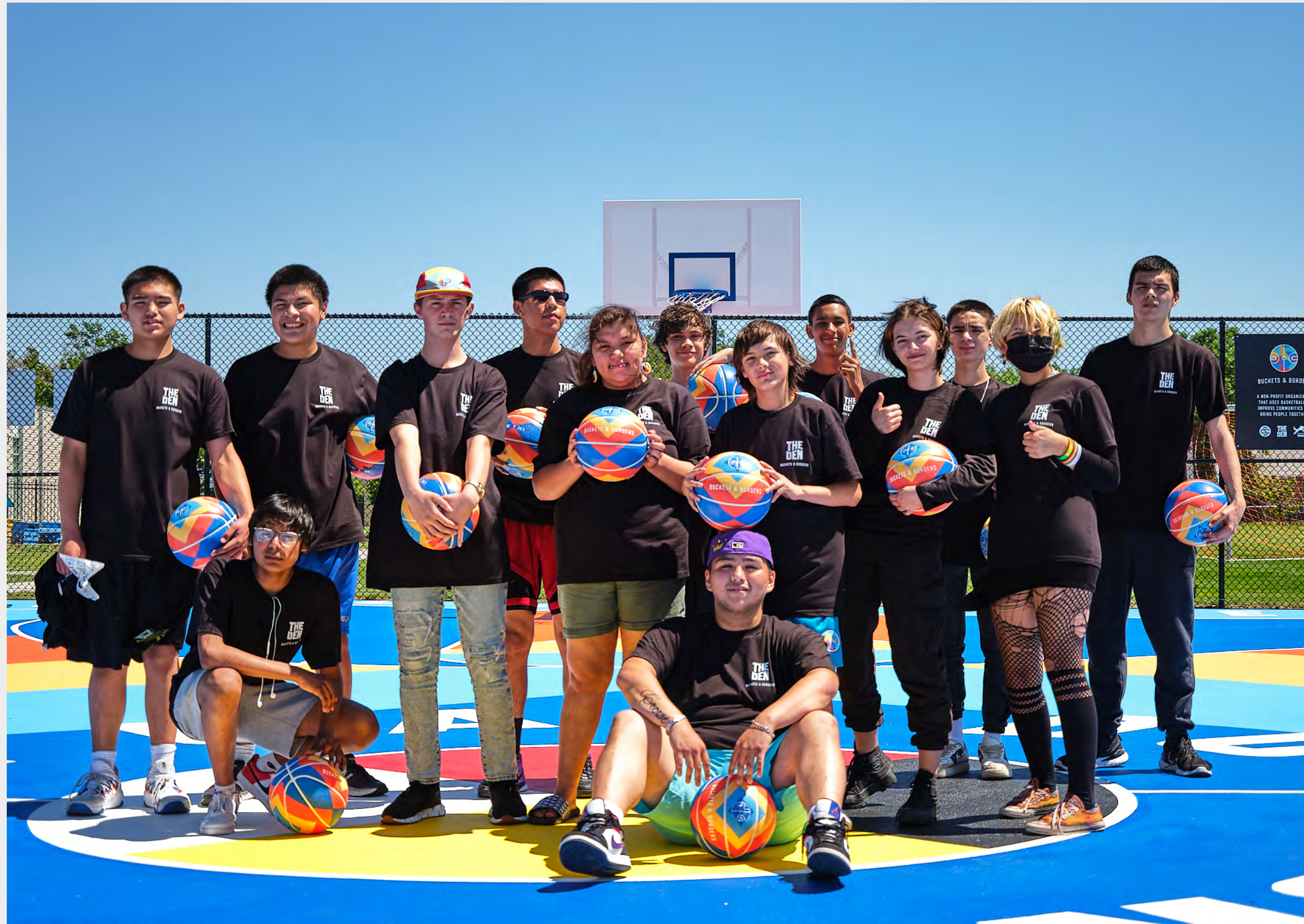
The Wolves Den - Centre Court "I Can Do All Things" Mural Artwork Designed by Scott Collegiate Students mâdawêyatitân centre Regina, Saskatchewan