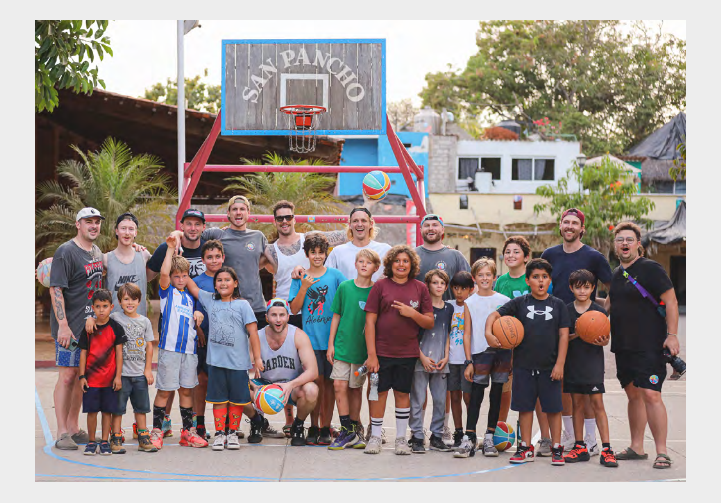
Buckets & Borders incorporated as a nonprofit organization in 2021. The organization is led by a group of friends who grew up playing basketball together on the prairies.

Buckets & Borders began in 2015 as an initiative to document basketball culture around the world, and inspired the mandate to improve communities and bring people together through basketball.