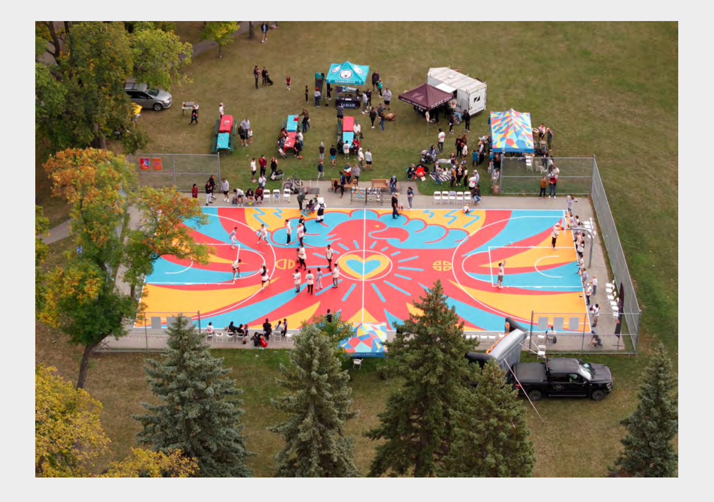
To date Buckets & Borders has completed major projects in Saskatchewan, Manitoba, Ontario, and Mexico.The goal is to restore 25 courts by 2025.