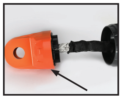
At this point you can install the insert into the aluminum shackle mount body.