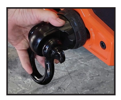
Lastly, install shackle to aluminum shackle body. Winch in to secure shackle mount in to place firmly against fairlead.