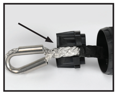
4. Open up the insert and slide into rope or cable.