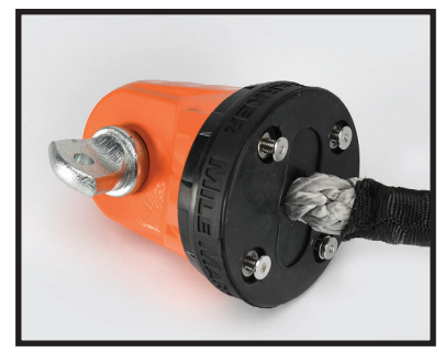
Slide backing plate over aluminum shackle mount. Line up the 4 allen holes. Securely tighten the 4 allen screws.