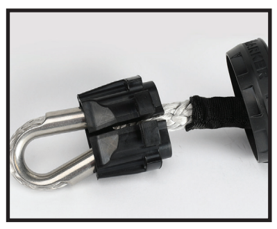
Be sure not to pull the insert too far over the end of the rope or cable.