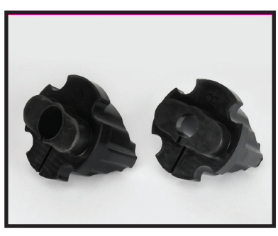
Select correct insert. Each insert is marked with R (for synthetic rope) or C (wire cable).