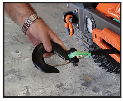
To install, remove old hook. On most hooks, you will need to remove cotter and pin to remove from cable or rope. Some hooks you will have to cut.