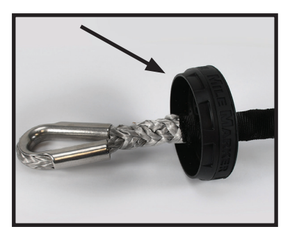
First, install the backing plate on to the cable or rope as pictured above.