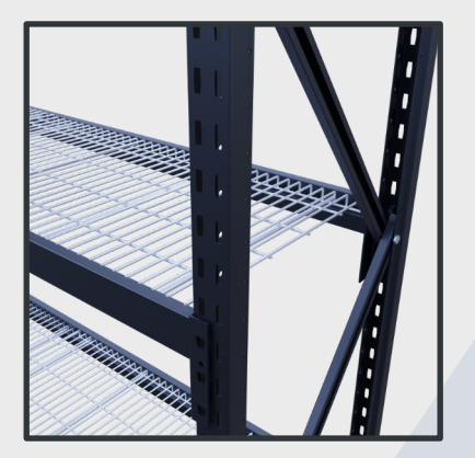
Steel Mesh Shelves

Add On Bays come with one End Frame and are for expanding Full Bays or Steelspan Modules.