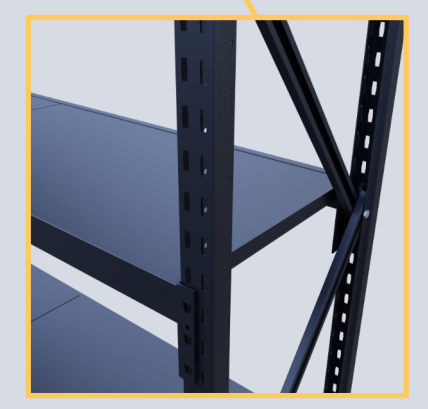
Black Powder Coated Steel Shelves

ALSO AVAILABLE Tyre Storage Shelving & Plastic Tub Shelving.