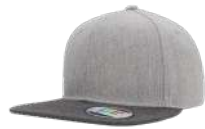
grey melange/ charcoal melange