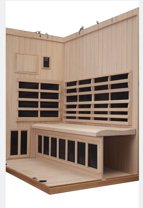
Actual Assembly - Clearlight Sanctuary 3

For more information: www.purelyrelaxation.com contact@purelyrelaxation.com