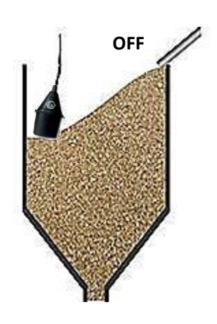
When the high level is reached, the level sensor tilts and stops filling the silo