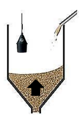
When the silo fills up, the level sensor is suspended vertically.