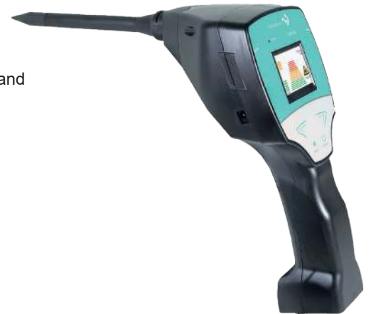
LD 400 with focus tube and focus tip for precise locating.