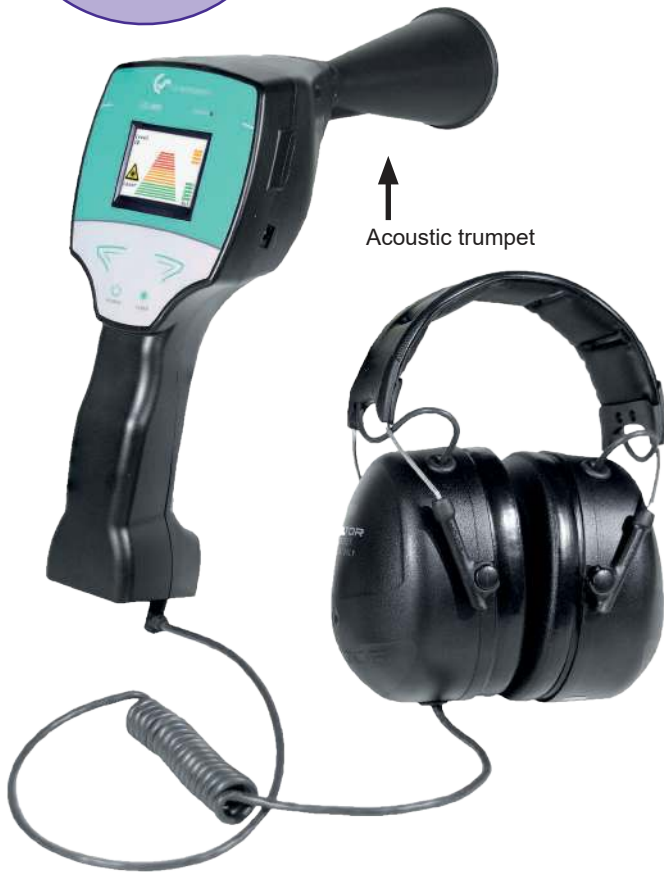
↑ Acoustic trumpet

Sound-proof headset enables: leak detection in extremely noisy environments