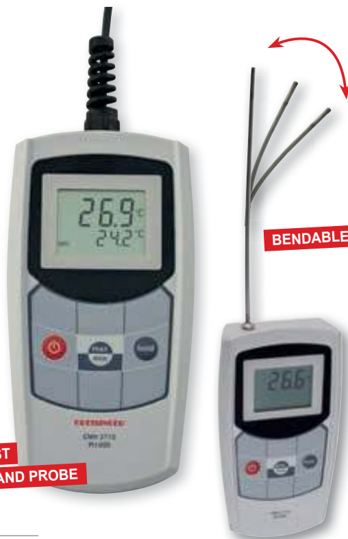
GMH 2710-F GMH 2710-I