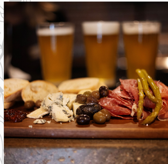
Tapas style bites

SEMI-PRIVATE - $400 RENTAL FEE - NO MINIMUM SPEND