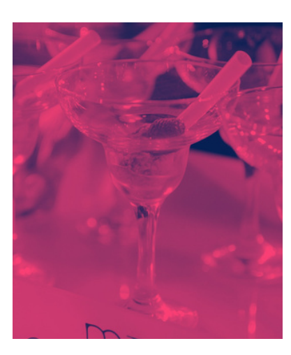
RASPBERRY ROSE LYCHEE