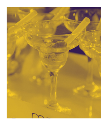
LEMONGRASS LIME FIZZY SODA