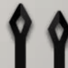
STEEL ANDIRONS IN CHARCOAL FINISH