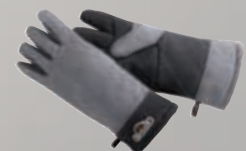
HEAT RESISTANT GLOVES INCLUDED